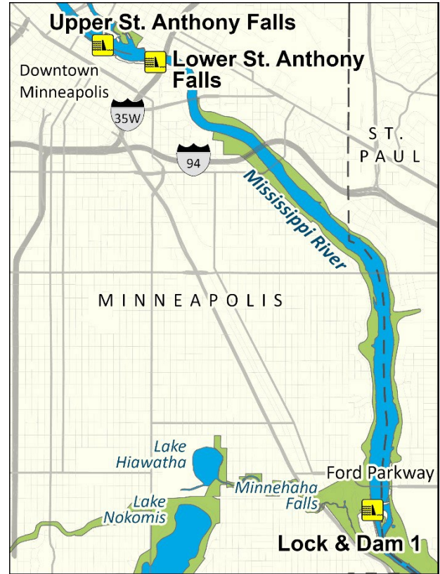
Dakadaha iyo Dhaamamka Wabiga Mississippi ee Twin Cities

2016, Ciidanku waxa uu bilaabay daraasada wareejiyenka sadex dakadood iyo dhaamam Minneapolis ah. 2018, Ciidanka waxaa loo sheegey inay kala saaraan daraasada Upper St. Anthony Falls iyo Lower St. Anthony Falls iyo daraasada Dakada iyo Dhaamka 1.